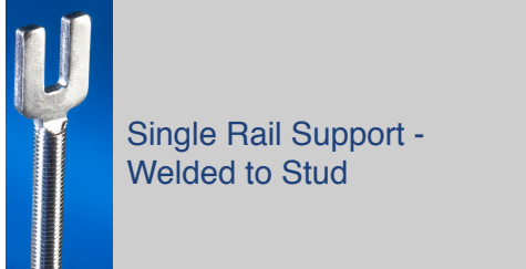
Single Rail Support - Welded to Stud