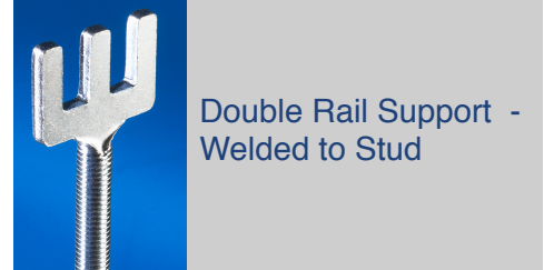
Double Rail Support - Welded to Stud